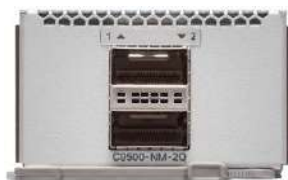
Figure 10. Cisco Catalyst 9500 Series network module 2-port 40 Gigabit Ethernet with QSFP+