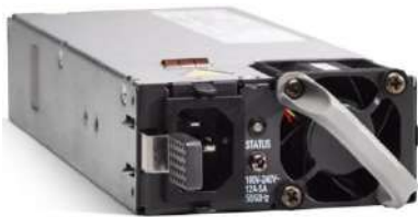
Figure 12. 950W AC power supply

Figures 12 through 14 show the power supplies available for the Cisco Catalyst 9500 Series