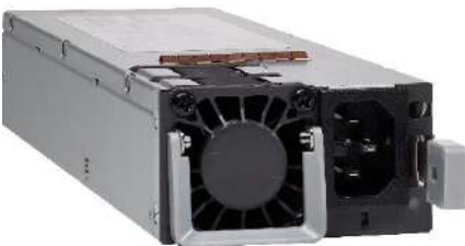
Figure 14. 1600W AC power supply