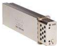
Figure 11. 240-GB SSD storage