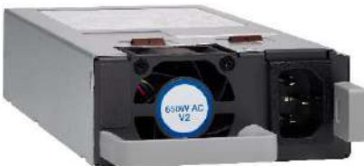
Figure 13. 650W AC power supply