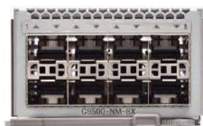
Figure 9. Cisco Catalyst 9500 Series network module 8-port 1/10 Gigabit Ethernet with SFP/SFP+

Figures 9 and 10 show the available network modules