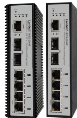
12V model 48V model